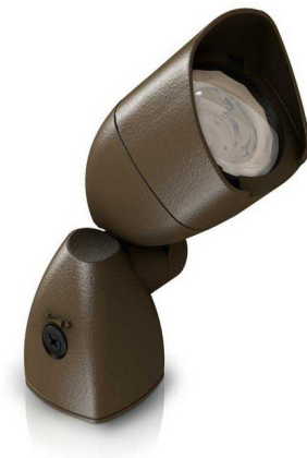
Shown in bronze

LAMP LIFE . . . . . 50000 hours COLOR RENDERING . . . . . 70 CRI LAMP COLOR . . . . . 3000K