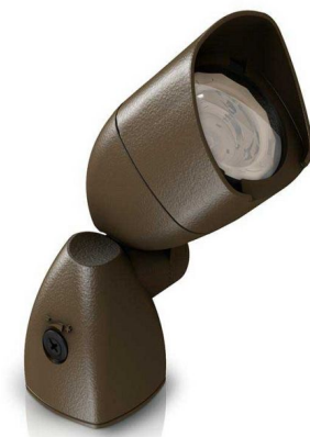
Shown in bronze

LAMP LIFE . . . . . 50000 hours COLOR RENDERING . . . . . 70 CRI LAMP COLOR . . . . . 3000K