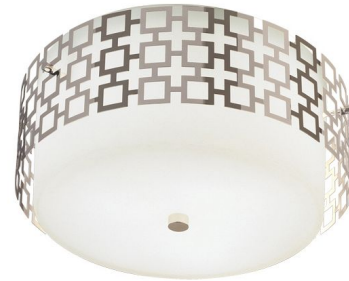
Shown in polished nickel / frosted

The Parker Ceiling Flush Mount features a frosted white cased glass diffuser with a laser cut frame in Polished Nickel finish.