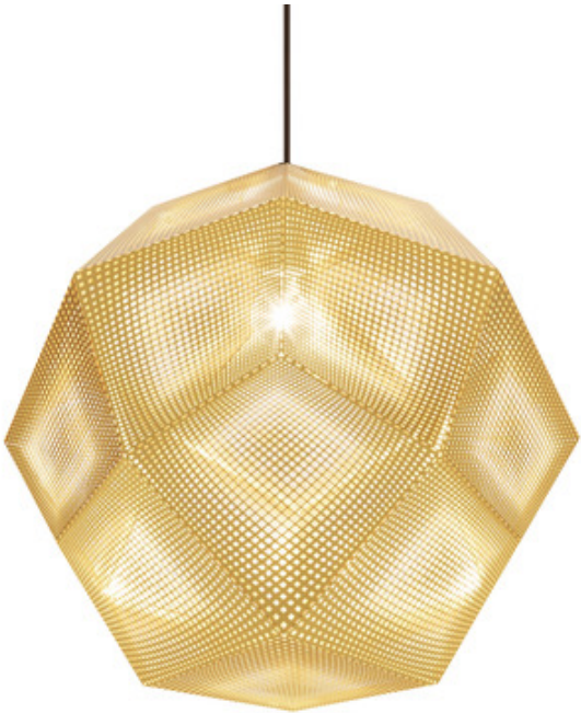
Shown in: Brass

The Etch 50 Pendant is formed of finely pierced flat metal sheets tabbed together like Victorian tin toys. Using digital acid etching methods, Etch is patterned for the effective filtering of light designed to cast an intricate set of shadows. Shown in off and on. Designed in London.