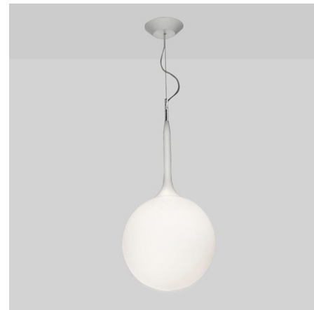
Shown in white / white

COLOR . . . . . White BODY FINISH . . . . . White WATTAGE . . . . . 17W DIMMER . . . . . Standard 120V DIMENSIONS . . . . . 98.1"L x 13.75"W BULB NOT INCLUDED . . . . . 1 x A21/Medium (E26)/17W/120V LED COUNTRY OF ORIGIN . . . . . Italy