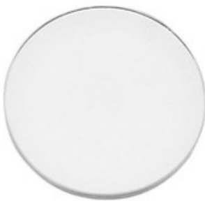
Shown in: White / Lensed