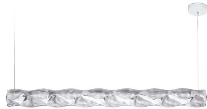
Shown in white / prisma