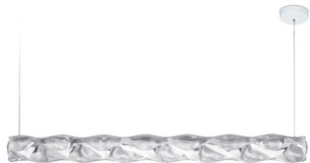
Shown in: White / Prisma

Hugo Linear Pendant, designed by the Slamp Team, runs along the space from one end to the other, parallel to the floor, sideways, perpendicular. It customizes the environment with a sinuous design. Using multiples in a longitudinal mode or in a free sequence is an individual choice, suitable for both a decorative project as well as for technical illumination. Hugo Linear Pendant features Slamp's patented material lentiflex Prisma or techno-polymer White.