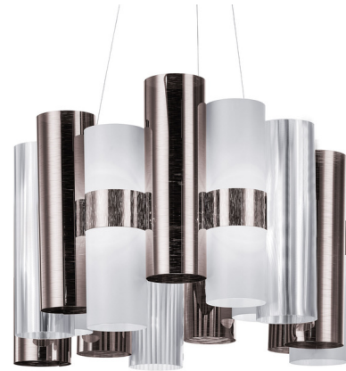
Shown in white / pewter white

PRODUCT DIMENSIONS . . . . . Cord Length: 55" COLOR RENDERING . . . . . 90 CRI LAMP COLOR . . . . . 2700K LUMENS/WATT . . . . . 115.00 LUMINOUS FLUX . . . . . 4600 lumens