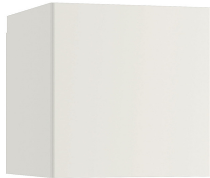
Shown in matte white

The Laser Wall Sconce designed by Studio Italia Design features an up and down lighting effect perfect for illuminating a wall. Laser's cubic silhouette gives it a geometric, modern expression, but its straightforward style can complement a variety of decor styles.