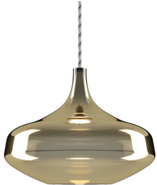
Shown in: Chrome / Gold

The Nostalgia 03 Pendant, designed by Dima Loginoff, is an elegant representation of ancient glass blowing techniques, the blend retro shapes with modern lines. This versatile piece can stand alone or be grouped together with its sister pendants to create your own unique look. Includes ceiling canopy in white finish. Dimmable with Triac dimmers.