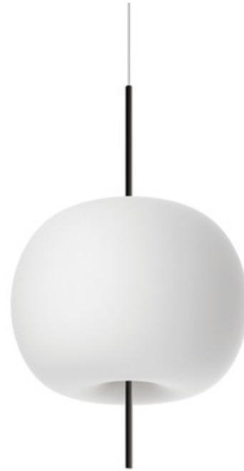
Shown in: Black / Opal

The Kushi Pendant offers a playful design with a modern edge, featuring a diffuser composed of two layers of blown Opal glass with a Black, Copper, or Brass accent rod piercing through to create a silhouette reminiscent of a candied apple.