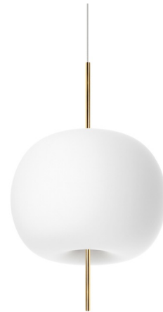
Shown in brass / opal

The Kushi Pendant offers a playful design with a modern edge, featuring a diffuser composed of two layers of blown Opal glass with a Black, Copper, or Brass accent rod piercing through to create a silhouette reminiscent of a candied apple.