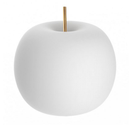
Shown in copper / opal

The Kushi Table Lamp features a diffuser composed of two layers of blown Opal glass with a Black, Copper, or Brass accent rod piercing through to create a silhouette reminiscent of a candied apple. On/Off switch on cord.