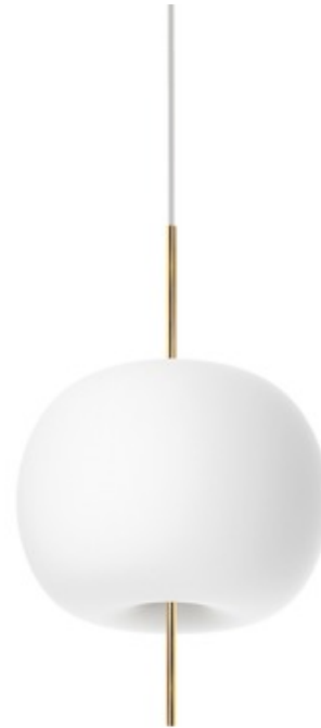
Shown in: Brass / Opal

The Kushi LED Suspension offers a playful design with a modern edge, featuring a diffuser composed of two layers of blown Opal glass with a Black, Copper, or Brass accent rod piercing through to create a silhouette reminiscent of a candied apple. CE listed.