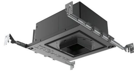
Shown in black powder coat