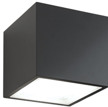
Shown in black / silk screened

The Bloc Outdoor Up Down Wall Sconce features a minimalist design in form but provides the superior amounts of light through the LED light. The body is crafted from die-cast aluminum with a factory-sealed glass lens that is silk screened with ceramic to diffuse the light evenly up and down the wall. Available in three finishes and 3000K color temperature. Note: 2700K and 4000K color temperature options are special order items.