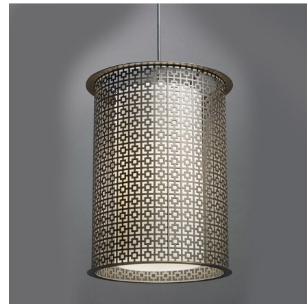
Shown in chrome / opal

Clarus Round Shade Geometric Cutout Pendant features an Opal diffuser with a Cast Bronze, Chrome, or Black finish. Available in small and large sizes with Incandescent or LED lamping options Incandescent: 60 watt, 120 volt A19 type medium base incandescent bulbs are required, but not included. LED: One 16 watt, 120 volt 3000K 85CRI LED module is included. Made in the USA. UL and cUL listed. Small: 8 inch width x 30 inch height x 96 inch maximum length. Medium: 12 inch width x 18 inch height. Large: 18 inch width x 30 inch height x 96 inch maximum length. SMALL IS NOT AVAILABLE WITH LED LAMPING.