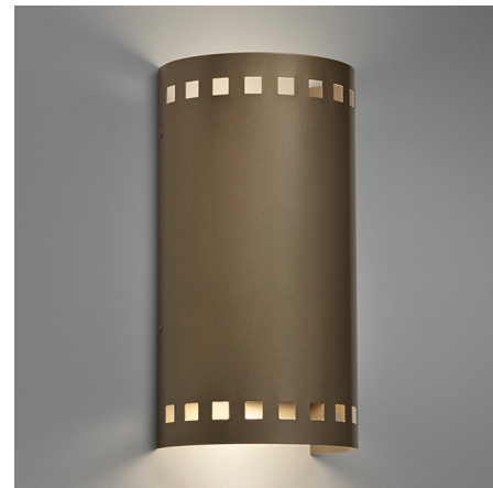
Shown in cast bronze

The Basics Cutout Wall Sconce brings a clean, decorative look to your interior space. The smooth aluminum frame add an architectural vibe, while the cutouts at both ends emits light outwards as well as up and down. May be mounted horizontally or vertically. Note: Available with a standard dimming A-type 60 watt max incandescent bulb, a retro-fit standard dimming A-type 20 watt max LED bulb, a standard dimming 8.4 watt integrated LED module, or a 0-10V dimming 9.38 watt integrated LED module.