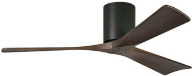
Shown in: Matte Black / Walnut

The Atlas Irene Hugger Ceiling Fan is rustic yet strikingly modern, with cleanly joined solid wood blades and a minimal cylindrical motor housing. Its streamlined profile with the warm, natural look of wood works beautifully in contemporary and transitional spaces. Equipped with a DC motor, the fan is energy efficient and ultra-quiet. A hand-held remote control and wall control are included, both able to turn the motor on/off and set 6 speeds and forward/reverse. For fans that have a light, the controls also turn the light on/off and dims it. Fans that have a light include a cap matching the housing finish for no-light use. Note: Some combinations of motor finish, blade color, and light option are not available.