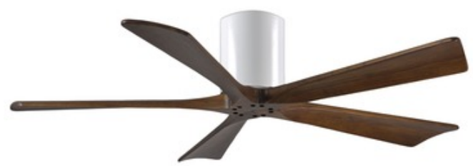
Shown in: Gloss White / Walnut

The Atlas Irene Hugger Ceiling Fan is rustic yet strikingly modern, with cleanly joined solid wood blades and a minimal cylindrical motor housing. Its streamlined profile with the warm, natural look of wood works beautifully in contemporary and transitional spaces. Equipped with a DC motor, the fan is energy efficient and ultra-quiet. A hand-held remote control and wall control are included, both able to turn the motor on/off and set 6 speeds and forward/reverse. For fans that have a light, the controls also turn the light on/off and dims it. Fans that have a light include a cap matching the housing finish for no-light use. Note: Some combinations of motor finish, blade color, and light option are not available.