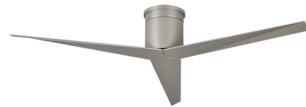
Shown in brushed nickel / brushed nickel

The Atlas Fan Eliza Hugger Ceiling Fan features a unique blade shape designed to maximize air movement at the outer edge of the blade, resulting in more efficient air velocity rings, less blade drag, and greater motor optimization. DC motor constructed of cast aluminum and heavy stamped steel in Brushed Nickel, Matte Black or Gloss White finish with Brushed Nickel, Gloss White, Matte Black, Walnut, Barn Wood, Grey Ash, or Old Oak blades. 56 inch blade span and 27 degree blade pitch. Includes a 6-speed RF remote control with reverse function in Black, and a 6-speed wireless Decora-style wall control in White. ETL listed. All finishes rated for damp locations. Lifetime limited warranty.