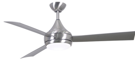
Shown in brushed stainless steel / brushed stainless

LAMP LIFE . . . . . 60000 hours COLOR RENDERING . . . . . 90 CRI LAMP COLOR . . . . . 3017K LUMENS/WATT . . . . . 45.31 LUMINOUS FLUX . . . . . 725 lumens