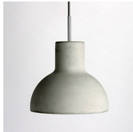
Shown in white / concrete

Concrete Bell Pendant desires to challenge your every perception of texture and lighting. As a material, concrete is exceptionally energy efficient compared to that of metal or glass. By using concrete as a lampshade the pendant has responsibly kept in tune with concepts of green living in mind. Comes with 6.5 feet of cord to customize length.