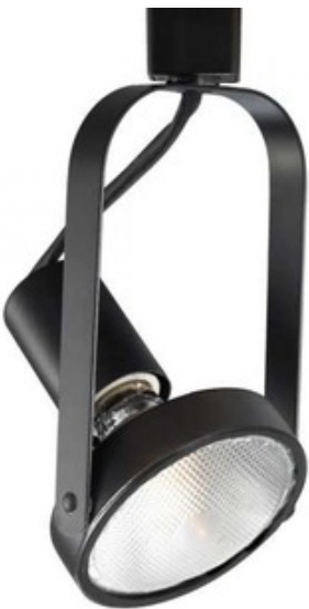
Shown in: Black

Line Voltage Gimbal Track Head is made of formed metal with powder coat finish in Black, Brushed Nickel, or White with a polycarbonate track adapter. Features a double yoke design for easy aiming. 350 degree horizontal rotation and 90 degree vertical tilt. Easily re-lamped from the front without the use of tools. Open back design for an industrial look. UL listed. Choice of H, J, or L Track System compatibility. Compatibility: L: WAC L Series and Lightolier Lytespan 120 volt single circuit track (Lightolier track by others) J: WAC J Series single circuit track and Juno 120 volt single circuit and two circuit track systems H: WAC H Series and Halo 120 volt single circuit line voltage track system (Halo track by others)