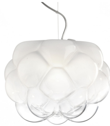
Shown in white / white / clear

Cloudy was created using extremely complex steel molds which have given it an almost magical lightness, like a glass cloud floating in the air. When switched on, Cloudy reveals all its luminosity and evokes the feeling of sunlight after the rain. Originally conceived as an art piece, the initial concept to turn Cloudy into a production element required the creation of the complex mold design unlike any other used in glass blowing. Note: Both lamp options available for 15.7 inch size only.