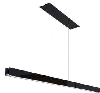
Shown in black glass / no louver

LAMP LIFE . . . . . 50000 hours COLOR RENDERING . . . . . 92 CRI LAMP COLOR . . . . . 3000K LUMENS/WATT . . . . . 152.00 LUMINOUS FLUX . . . . . 1140 lumens