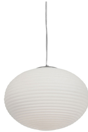
Shown in brushed steel / opal

The Callisto Pendant features metal construction with an opal glass diffuser. Available in two sizes. Energy Star, JA8-2016/Title 24 and Title 20 for LED only. Suitable for commercial or residential use.