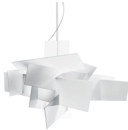
Shown in white / white

PRODUCT DIMENSIONS . . . . . Cable Length: 126" COLOR RENDERING . . . . . 90 CRI LAMP COLOR . . . . . 3000K LUMENS/WATT . . . . . 79.51 LUMINOUS FLUX . . . . . 3260 lumens