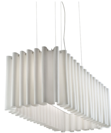
Shown in white / white