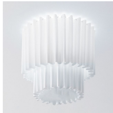
Shown in white / white

The Skirt takes inspiration from the world of fashion, in particular from the garment of the same name. Its lampshade is made from recycled plastic with sound-absorbing properties which allow it to reduce noise by up to 53%. White internal diffuser included. Phase cut dimming on option with E26 base included. Sound Performance: Equivalent Absorption Area which reaches a maximum of 3.55.