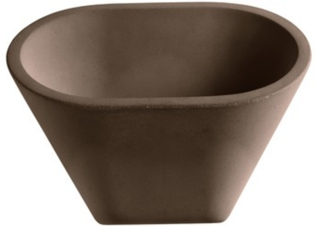
Shown in: Brown

The Aplomb Wall Sconce features a cement construction available in White, Grey, or Brown.