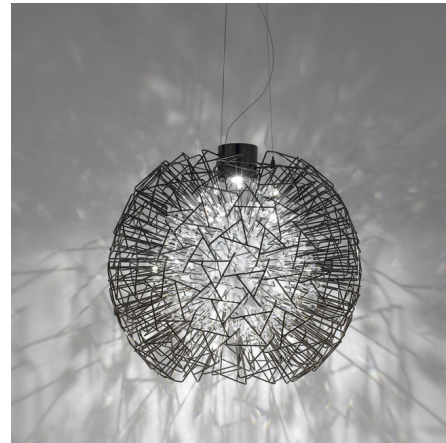
Shown in black nickel / crystal

Core Pendant, designed by Christian Lava, is reminiscent of the natural energy at the heart of our world. Like bright lava seeping through the Earth's crust, vibrant spheres of faceted Crystal break through the finish, creating a powerful, vibrant exchange of shadows and light that erupt across the room.