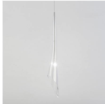
Shown in nickel / crystal

Calle Mini Pendant, designed by Luca Martorano and Mattia Albicini, features lead Crystal glass that mimics a calla lily flower, with a Nickel finish.