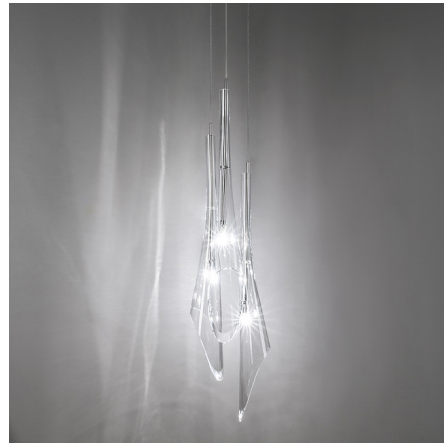
Shown in nickel / crystal