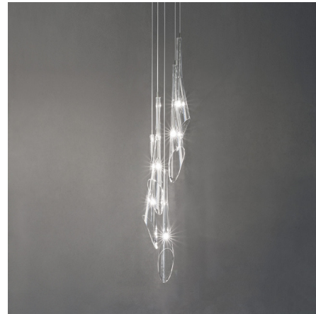
Shown in nickel / crystal