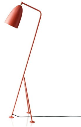
Shown in vintage red