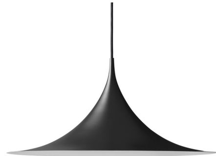
Shown in matte black