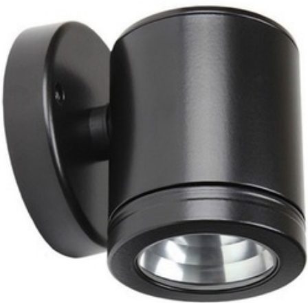
Shown in: Black

The Down Light Halogen Wall Light features a fixed head to give a dramatic one way, wash-lighting effect on walls. It can be mounted either up or down and is suitable for mounting onto timber, masonry or stone. Available in 316 Stainless Steel, Copper, or powder coat Black or Bronze finish with extra clear shatter resistant step glass lens. Supplied with a mounting base and stainless steel screws. IP66 rated for wet locations. Required transformer and optional accessories sold separately. Wall box adapter kit required when mounting to a 4 inch junction box, sold separately. Dimmer type dependent on type of transformer/ power supply selected (low voltage electronic or low voltage magnetic).