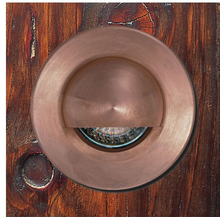
Shown in copper

The Step Lite Solid Eyelid Outdoor Light is designed with a 3.5 inch flange and recessed body for flush mounting into canister for concrete masonry, stone or wood, providing illumination of steps and low level features such as exterior paved areas. When used with Hunza mounting canister there are no mounting holes in the flange. The eyelid feature eliminates all upward light, providing an excellent glare-free illuminating effect. Machined from thick aluminum in powder coat finish Bronze or Black, solid Copper, or 316 Stainless Steel with a clear tempered stepped glass lens. UL listed. IP67 rated for wet locations. Required mounting canister (DKcan for wood or SLcan for concrete or stone) and low voltage transformer, sold separately. Dimmer type dependent on type of transformer/ power supply selected (low voltage electronic or low voltage magnetic).