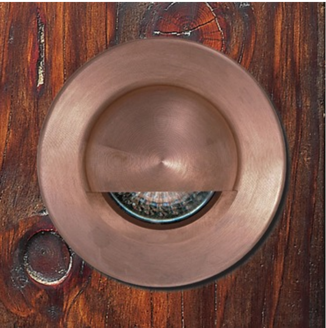
Shown in: Copper

The Step Lite Solid Eyelid Outdoor Light is designed with a 3.5 inch flange and recessed body for flush mounting into canister for concrete masonry, stone or wood, providing illumination of steps and low level features such as exterior paved areas. When used with Hunza mounting canister there are no mounting holes in the flange. The eyelid feature eliminates all upward light, providing an excellent glare-free illuminating effect. Machined from thick aluminum in powder coat finish Bronze or Black, solid Copper, or 316 Stainless Steel with a clear tempered stepped glass lens. UL listed. IP67 rated for wet locations. Required mounting canister (DKcan for wood or SLcan for concrete or stone) and low voltage transformer, sold separately. Dimmer type dependent on type of transformer/power supply selected (low voltage electronic or low voltage magnetic).