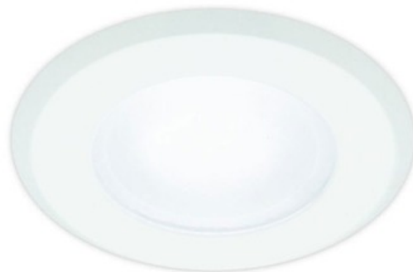
Shown in: Matte White / Frosted

S3400 3.5 Inch Beveled Shower Trim is made of plated die-formed steel or powder coat painted finish with anodized aluminum reflector and frosted lens. Trim finish available in White, Black, Gold Plated 24K, Chrome, Brushed Chrome, Architectural Bronze, Antique Copper, Matte White, Brushed Nickel, Satin Nickel, Metallic Grey or Antique Nickel. Additional reflector options include specular Black or Clear, or painted White, Black or Matte White. See attached manufacturer specification for housing/trim combination options. Lamp options include 12 volt GU5.3 MR16 halogen up to 50 watts, 120 volt PAR16 LED up to 8 watts, 12 volt GU5.3 MR16 LED up to 11.5 watts, 120 volt GU10 MR16 halogen up to 50 watts, and 120 volt GU10 MR16 LED up to 9.8 watts. See housing specification for dimmer information. UL listed. Suitable for wet locations. 1 year warranty. 3 5/8 inch ceiling cutout. 4.4 inch round x 2.25 inch height. 2.6 inch round aperture. A complete fixture includes a housing and trim, sold separately.