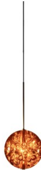
Shown in: Satin Nickel / Amber

Fast Jack LED Bubble Ball features cool-to-the-touch bubble glass available in Clear or Amber. Includes one 1.5 watt, 12 volt, 2700K color temperature LED lamp, 80CRI, (equivalent to a 10-15 watt halogen). 50,000 hour average lamp life. Finish in Satin Nickel. Includes field cuttable suspension cable in 10, 20 or 30 foot length and a Fast Jack heavy duty male connector (FJ-MCH). Order fixture based on longest desired cable length. Compatible with Edge Lighting, 1-circuit and 2-circuit Monorail, Fast Jack canopy, or line voltage track transformer. ETL listed. Fast Jack canopy required for use as a monopoint, sold separately.