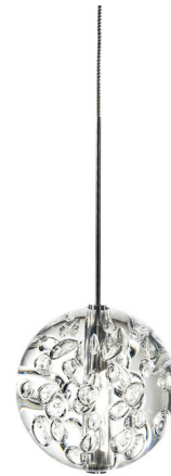
Shown in satin nickel / clear

LAMP LIFE 50000 hours COLOR RENDERING .80 CRI LAMP COLOR 2700K