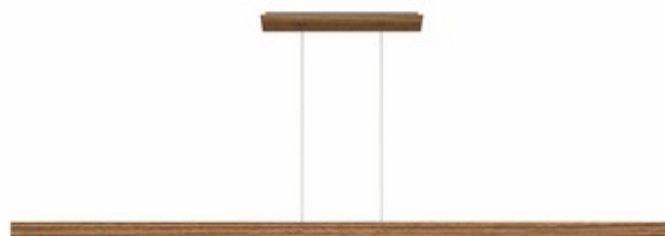
Shown in: Wood Cherry / No Louver

Glide Wood Up/Down Center Feed Linear Suspension is a two-circuit system featuring both direct and indirect LED light. Available in a spectrum of color temperature options with 7 watts (2W up and 5W down), 10 watts (5W up and 5W down) or 12 watts (5W up and 7.5W down) per foot. Offered in 12 inch increments from 36 to 120 inches. Available in Walnut, Cherry, White Oak, Espresso or Maple wood finish with 100 degree diffused white downlight lens, 60 degree clear frosted uplight lens, and optional black or white louvers. Includes rectangle canopy with 120V input/24VDC output Universal (UNI) LED power supply. Dimmable with an electronic low voltage (ELV), 0-10V, or Triac (magnetic) dimmer, sold separately. Note: Product is built to order.