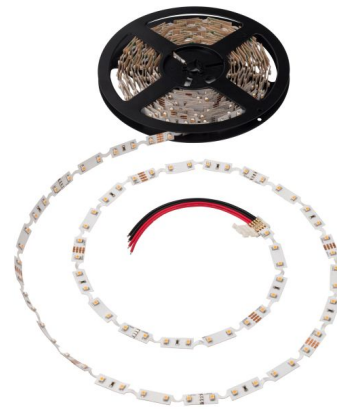
Shown in clear