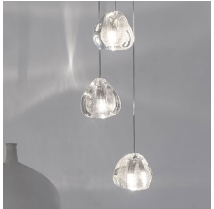
Shown in: Brushed Nickel / Silver Dust

The Mizu Round Multi Light Pendant is hand-made and inspired by tranquil and mesmerizing light refractions created by water. Like water droplets, no two Mizu fixtures are alike. Each crystal shape is unique. Made from 24 percent lead, the clearest crystal perfectly emulating water's refraction of light. Available with 3, 7, 15 or 26 pendants. Note: Not all options available.