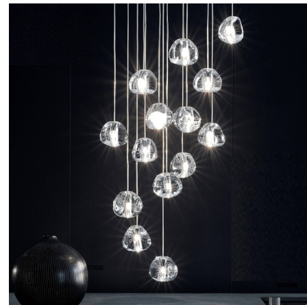
Shown in white / silver dust

The Mizu Linear Multi Light Pendant is hand made and inspired by tranquil and mesmerizing light refractions created by water. Like water droplets, no two Mizu fixtures are alike. Each crystal shape is unique. Made from 24 percent lead, the clearest crystal and perfectly emulates water's refraction of light and creating amazing patterns around a room. All pendants are adjustable lengths on installation.