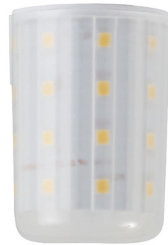
Shown in frost

This new LED Bi-Pin Replacement Pendant Module marks a significant advancement in LED replacement lamps. Available in a short and long option. Made by Soraa, in collaboration with and exclusively for Generation Brands (Tech Lighting's parent company). It produces balanced omnidirectional light for uniform glass illumination. Backward compatible into standard GY6.35 base halogen or xenon incandescent bi-pin lamp sockets - meaning it is plug and play with virtually all existing halogen/xenon bi-pin pendants. ETL listed. Suitable for damp locations. Title 24 compliant. 5 year warranty. Dimmable using Tech Lighting magnetic and electronic low-voltage transformers (dimmer type dependent on system transformer).