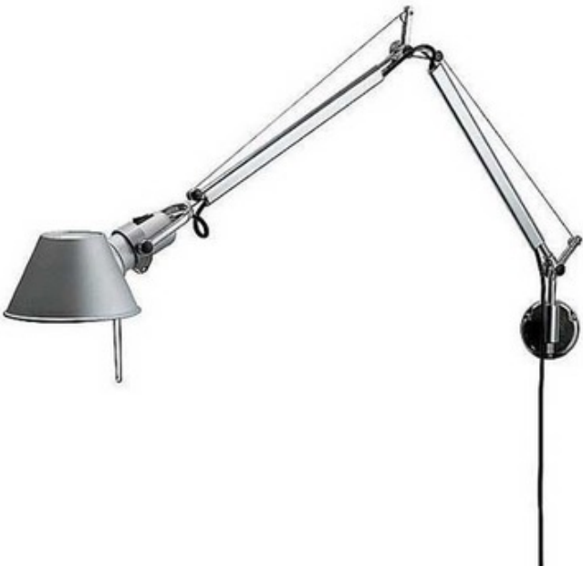
Shown in: Aluminum

Tolomeo Classic LED Plug-In Wall Light features a fully articulated arm, body structure, and diffuser in extruded natural anodized Aluminum. Joints and tension control knobs in polished die-cast aluminum and tension cables in stainless steel. Type S bracket suitable for wall surface mounting with cord and plug. Diffuser is tiltable and rotates 360 degrees on lampholder. On/off switch and dimmer included on head. Available with choice of 3000K or Artemide My White Light technology which allows Kelvin to be set anywhere between 2500K and 10,000K color temperature.