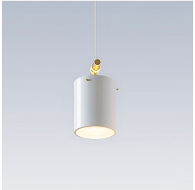
Shown in: White

Fresnel Pendant features Aluminum, Brass, and glass components. A light-diffusing fresnel lens sits inside of the fixtures powder coated aluminum drum, which is further suspended from a brass T-bar. One 12 watt, 120 volt GA19 dimmable LED bulb is included, 800 lumens. Small: 6.4 inch width x 11 inch height x 83 inch overall length. Medium: 9.4 inch width x 11 inch height x 83 inch overall length. Large: 12.25 inch width x 11 inch height x 83 inch overall length.