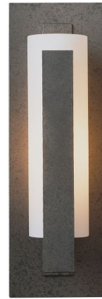
Shown in natural iron / opal

The Forged Tall Bar Wall Sconce brings a clean simple look to your interior space. A forged bar embraces the slim cylindrical glass diffuser. Limited lifetime warranty when installed in a residential setting. Handcrafted to order by skilled artisans in Vermont, USA.